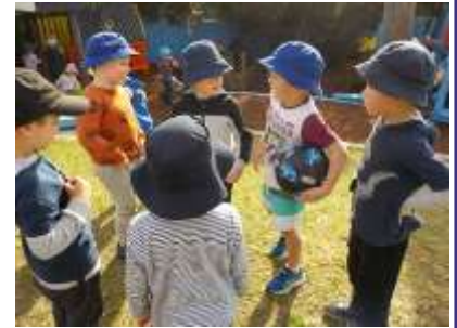
The children enjoyed sorting themselves into teams.

To reflect Kicking King's love and interest in practicing his kicking skills and playing football the children played with balls during outdoor play time. The balls were a huge hit with our Preschoolers. They even requested for goals to be set up so that they could carry out their own football game. They found themselves dividing into teams and others deciding to be the goalie and even a coach. During this experience it was great to see the children extend their knowledge of Kicking King's sound whilst exploring their physical wellbeing and the joys and pleasures of their social world.